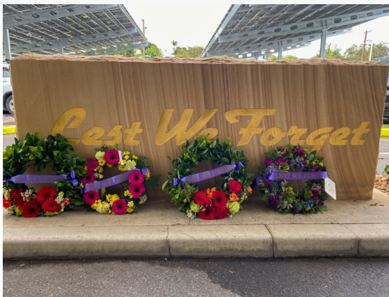
War Memorial at Breakers