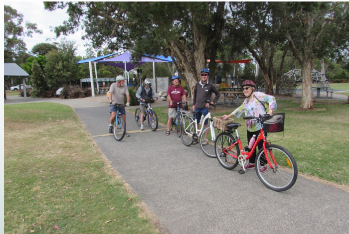
The cycling group at the start point—Getting ready 'TO GET MOVING'